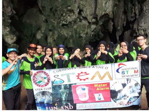
Figure 2: Exposure to real social-scientific issues.

During the STEM-based learning project, students have gone through six phases; engage, explore, explain, engineer, enrich, and evaluate. In the engage phase, students were exposed to social scientific issues before they doing their project. In engage phase students were given newspaper cutting about flood in Kelantan. After plan arrangement, the students decided to visit the flooded area, and find out the solution themselves (Figure 1 & Figure 2).