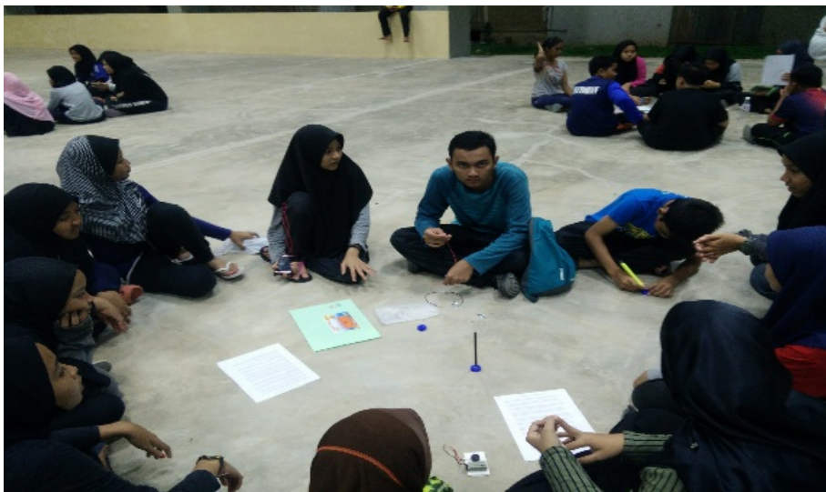
Figure 3: Sketch prototypes after discussion, explanation, and exploration the real flooded area.

During the STEM-based learning project, students have gone through six phases; engage, explore, explain, engineer, enrich, and evaluate. In the engage phase, students were exposed to social scientific issues before they doing their project. In engage phase students were given newspaper cutting about flood in Kelantan. After plan arrangement, the students decided to visit the flooded area, and find out the solution themselves (Figure 1 & Figure 2).