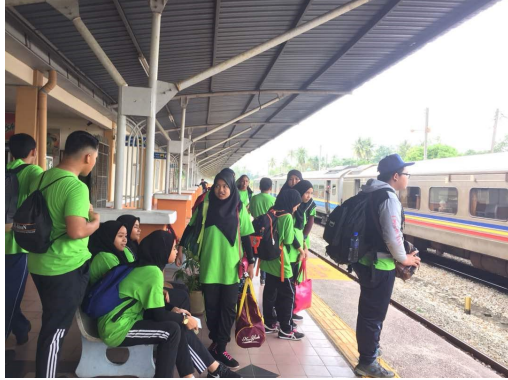
Figure 1: Side visit to Dabong to see the real area that flooded in 2014.

key component that drives both their exploration and their refinement of perception as they gather information and learn from their surroundings (Banning & Sullivan, 2011).