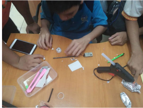
Figure 5: Students test their prototypes and make enrichment to improve.

In the engineering phase, students began to construct their prototypes by referring to the youtube channel and websites (Figure 4). While during the enrich phase, students test and make improvement to their prototypes (Figure 5). At this stage, students were the main keyperson to strengthen their hands-on ability and problem-solving competency. They find out from various resources such as youtube and websites to improve their prototypes. This stage emphasized in helping the students to clearly understand their design conceptions and reason. Students were encouraged to make corrections according to the feedback and suggestions thus improving their abilities in engineering.