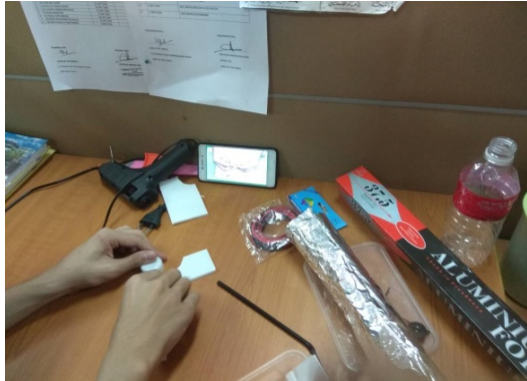
Figure 4: Construct prototypes by referred to the you-tube, or website in engineering phase.

During the exploration phase, students were also given a free opportunity to explore the problem and gather some information from any resources. At this stage, students were encouraged to explain and discuss with their peers to improve their ideas (Figure 3). In the explain phase, students have the opportunity to discuss the project with their group based on information obtained from the internet. Contribution of ideas were encouraged during this phase. Ideas will be combined and expanded.