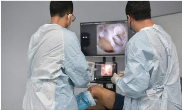
Figure 3: The operator (clinician) can directly visualise the image on the screen tablet throughout a procedure similar to OR arthroscopy

A valgus force was given to the patient’s knee to access the medial compartment, while the physician’s assistant provided a supporting force to the patient’s thigh. This dynamic leg movement is similar to that seen in standard OR arthroscopy. The lateral compartment was similarly accessed by gently placing the patient’s knee in the 90° flexion. Following the evaluation of the medial and lateral compartments, the ACL was evaluated. The ACL is seen in Figure 4, with the knee flexed to 90°. The image shows that fraying of ACL fibres with thinning of the ligament. Figure 5 shows the insufficiency of the ACL graft, which is peeling away from the intercondylar notch. The posterior cruciate ligament (PCL) showed vascularity but no laxity. The total procedure takes approximately 30 minutes and the patient had no complications or complaints throughout the procedure and post-procedure observation. He was then discharged with five days of oral antibiotics and oral analgesics. The International Knee Documentation Committee (IKDC) score was obtained before the procedure, 24 hours post-procedure, and one week after the OBNA. The results showed that IKDC had a total score of 57.5%, 58.6%, and 72.4%, respectively.