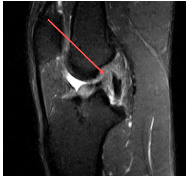
Figure 1: A T2 sagittal image showing an ACL graft laxity with high signal intensity and thickening associated with anterior tibial translation suspicious of a partial tear of the ACL graft

There was minimal effusion and no noticeable deformity or erythema on physical examination. The range of motion was restricted to the contralateral knee, with 5° extension deficit and 120° flexion. On palpation, there was tenderness along the medial joint line, lateral femoral condyle, and lateral tibial condyle. An anterior drawer test score of 2+, Lachman score of 2+, and positive apprehension with pivot shift testing were obtained from stability tests. There was no varus or valgus gapping on collateral ligament testing, and McMurry's sign was negative. The sensation, perfusion, and reflexes were symmetric and equal on both lower limbs. Motor testing shows that the quadriceps and hamstrings have a strength of 5/5. Because his radiographs were normal, the patient was scheduled for an MRI of his left knee (Figure 1). The radiologist and orthopaedic surgeon agreed that the patient had a high degree partial ACL injury with an ACL bony contusion pattern. The meniscus was intact, and the remainder of the knee joint was unremarkable. Ten days following his injury, the patient was offered an office-based diagnostic needle arthroscopy, which he agreed due to his limitation of movement and to identify whether there was any pathology causing the restriction. The OBNA procedure was performed for the first time in Malaysia on December 16 th , 2021, at the National Sports Institute clinic.