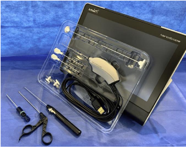
Figure 6: The needle arthroscopy setup, which includes an arthroscope with monitor, power cord, trocars with sheaths, inflow ports, and other equipment (NanoScope; Arthrex)

the surgeon or patient desires, these images can be saved on a storage device.