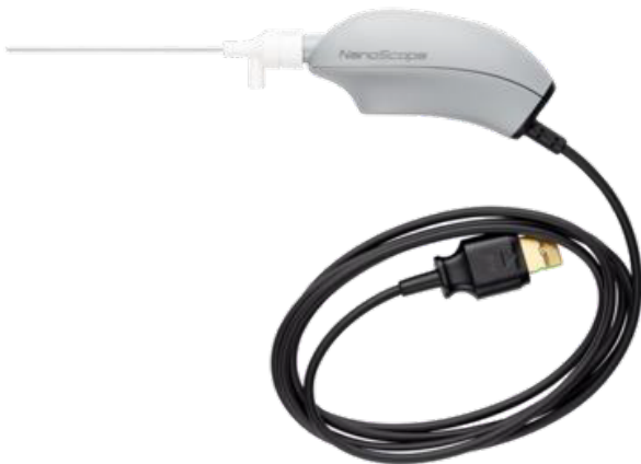
Figure 7: A close-up of the needle arthroscopy with a retractable outer sheath, 14-gauge, 95 mm length. This disposable needle arthroscopy has a 120° field of view and a 0° image

In our case, needle arthroscopy was used to identify symptomatic patients with occult imaging abnormalities. Although MRI is a practical and minimally invasive diagnostic tool, it is restricted by anatomic variations, artifacts, and pathological misinterpretation. Furthermore, a static MRI cannot match the improvement reported with a dynamic knee evaluation. For intra-articular knee pathologies, surgical arthroscopy remains the gold standard (9). Particularly in this case as discussed, OBNA can determine whether there is particular articular cartilage lesion or scarring from earlier trauma or surgery that causes the pain symptom since only low-field MRI