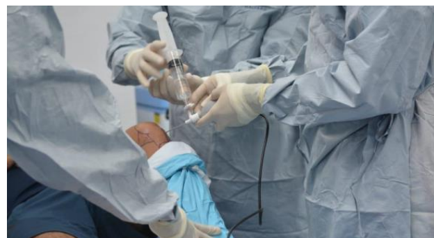
Figure 2: Insertion of the probe into the lateral portal of the left knee with the patient is lying on supine with knee flexed 90°. The syringe connected to the probe and stopcock is open and ready to distend the capsule

After explaining the benefits and disadvantages of an OBNA under local anaesthesia vs. an operating room (OR) arthroscopic assessment under anaesthesia, the treating clinician obtained informed consent from the patient. The patient was next positioned sitting up, and marked knees flexed to 90° off the bed's edge (Figure 2). After a standard sterile betadine and alcohol prep, the patient was anaesthetized in a lateral portal position with a 2 cc of plain lignocaine injected to the skin and 10 cc of plain bupivacaine mixed with 10 cc plain lignocaine injected into the joint. The skin and joint capsule needed to be numbed in a circular fashion. The procedure began once the skin was numbed. The intercondylar notches, as well as the medial and lateral compartments of the knee, were evaluated (Figure 3).