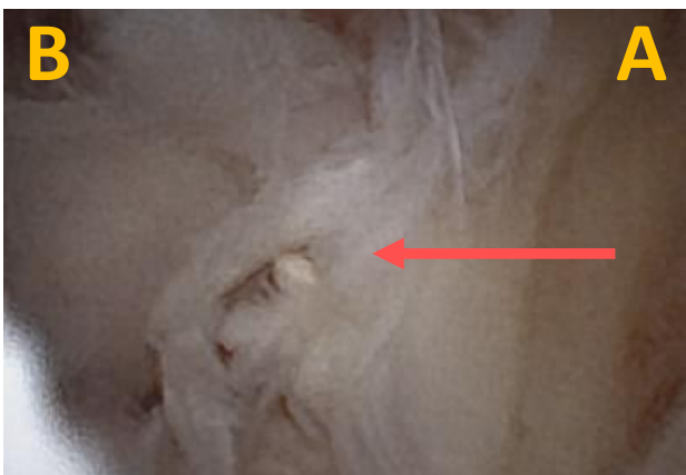
Figure 4: Viewed from the lateral portal with the knee flexed to 90°, there is fraying of ACL fibres with thinning of the ligament. (A: Lateral femoral condyle, B: Medial femoral condyle, Arrow: ACL remnant)

A valgus force was given to the patient’s knee to access the medial compartment, while the physician’s assistant provided a supporting force to the patient’s thigh. This dynamic leg movement is similar to that seen in standard OR arthroscopy. The lateral compartment was similarly accessed by gently placing the patient’s knee in the 90° flexion. Following the evaluation of the medial and lateral compartments, the ACL was evaluated. The ACL is seen in Figure 4, with the knee flexed to 90°. The image shows that fraying of ACL fibres with thinning of the ligament. Figure 5 shows the insufficiency of the ACL graft, which is peeling away from the intercondylar notch. The posterior cruciate ligament (PCL) showed vascularity but no laxity. The total procedure takes approximately 30 minutes and the patient had no complications or complaints throughout the procedure and post-procedure observation. He was then discharged with five days of oral antibiotics and oral analgesics. The International Knee Documentation Committee (IKDC) score was obtained before the procedure, 24 hours post-procedure, and one week after the OBNA. The results showed that IKDC had a total score of 57.5%, 58.6%, and 72.4%, respectively.