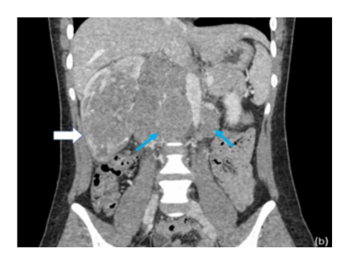
Figure 1: Baseline imaging - Baseline CT scan shows heterogeneous clear cell renal carcinoma (white arrow) with paraaortic lymphadenopathy (blue arrow).

Unfortunately, she started showing symptoms of abdominal pain and vomiting 2 months later. CT reassessment scan as shown in Figure 3 reported larger right renal mass measuring 11.5 x 8.8 x 17 cm with inferior vena cava thrombosis, worsening right paratracheal, abdominal nodal and lung metastases, new liver and bilateral ovarian metastases. She was started on tramadol for her abdominal pain and subsequently escalated to morphine for her symptoms control. At the same time, her pazopanib was increased to 800 mg once daily. At this recommended adult dose, she developed proteinuria with urine dipstick protein 1+ and 24-hour urine collection reported 0.74 g of urine protein. There was no other clinically significant adverse event reported. Thus, her pazopanib was continued at the same dose of 800 mg once daily.