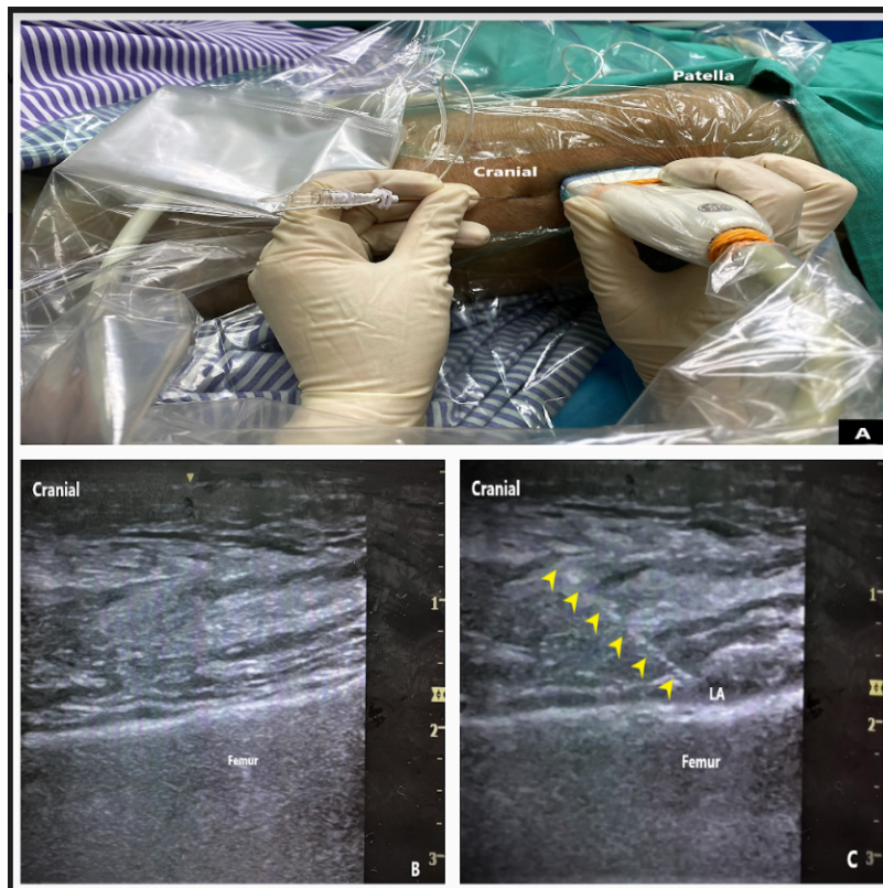
Figure 3: (A) Probe positioning and needle insertion for the right superior lateral genicular nerve block. (B) Sonoanatomy of the superior lateral genicular nerve injection. (C) Needle trajectory (yellow pointed arrow) and deposition of local anesthetic (LA) above the femur for the superior lateral genicular nerve injection.